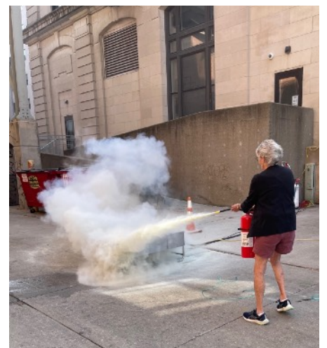
Clockwise from upper left: TRAIL members visiting the Beyond Van Gogh exhibit in Davenport, June; learning about home safety at Lowe's, January; taking part in a fire extinguisher demonstration, October; visiting Melrose Meadows as part of a senior living facilities series, May; and enjoying lunch at the Muscatine Button Factory, August.